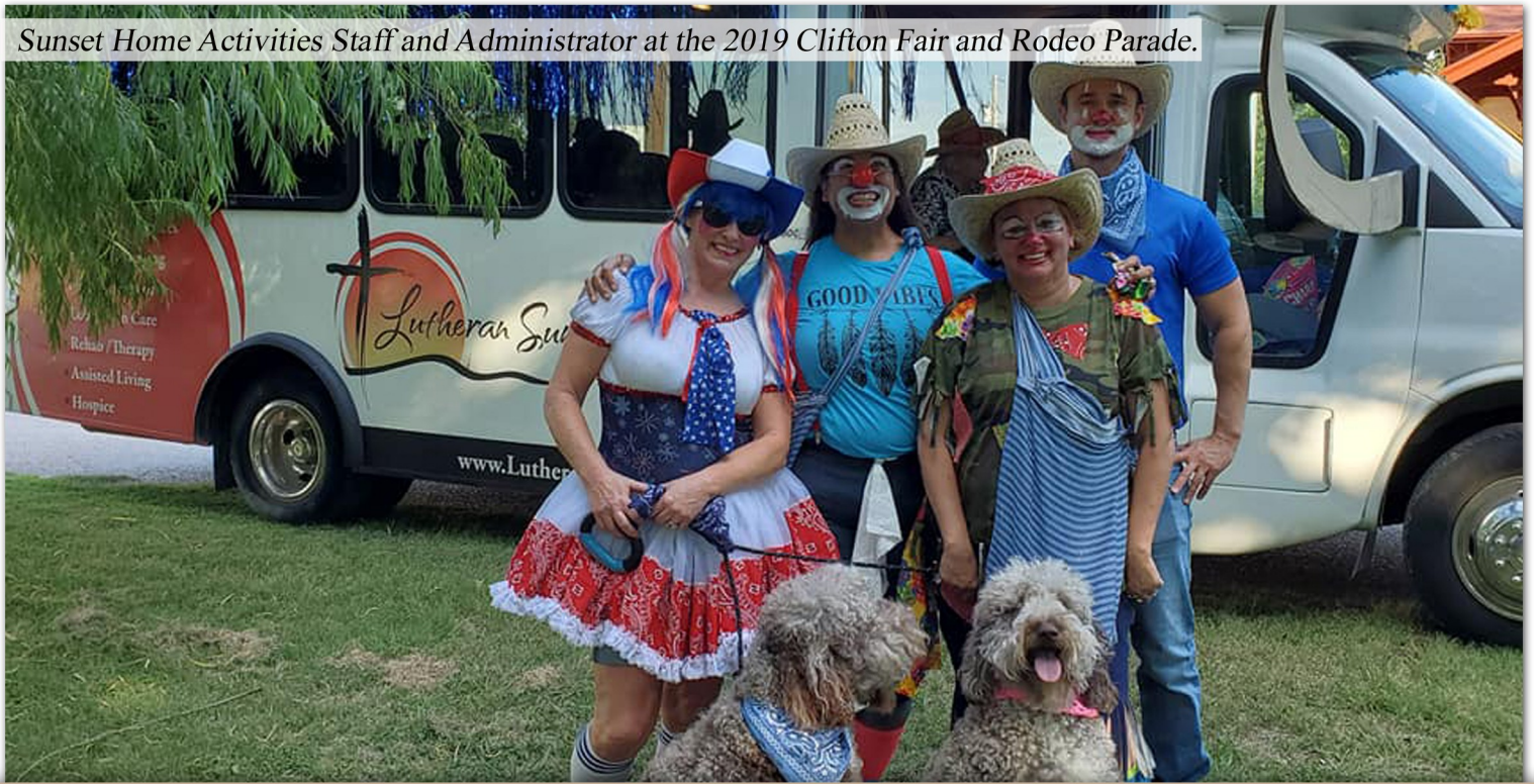
Sunset Home Activities Staff and Administrator at the 2019 Clifton Fair and Rodeo Parade.