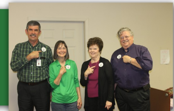
LSM board members and committee members were even caught "Living It!"