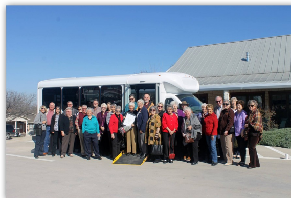
The new transportation bus purchased by Pot O' Gold funds in 2016.

Sunset Home • College Hill Assisted Living • Rainbow Retirement Community Hospice Sunset • Sunset Companion Services