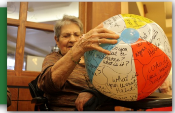
Playing a game of Beach Ball Q&A helped residents get to know one another, and staff to learn new things about the residents.