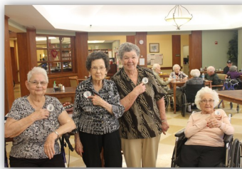
Sunset Home residents were caught "Living It!" by participating in Wii Bowling.

February was Living It! month, a program of Masterpiece Living. Living It was a four-week campaign to inspire and challenge our entire community to try new pursuits in the four components of wellness: physical, social, intellectual and spiritual. The research tells us that challenging ourselves with new and complex activities is not only good for our overall wellness but also stimulates the brain and promotes brain health. Additional benefits include meeting new people, having fun, getting creative and being part of the community-wide campaign. Lutheran Sunset Ministries' campaign was a success, with residents, staff and volunteers trying new things throughout the month.