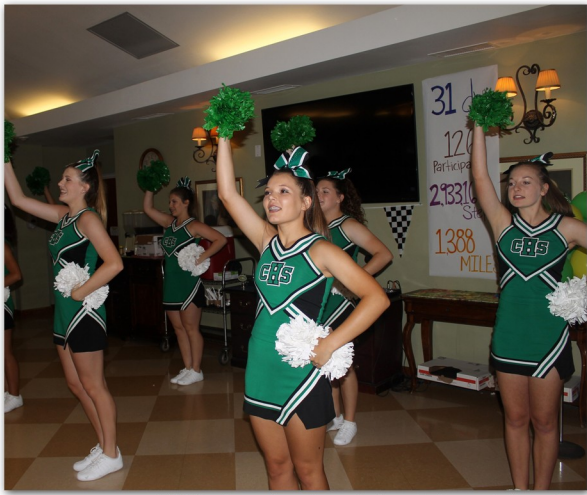
CHS cheerleaders joined the celebration.

In partnership with Masterpiece Living, a successful aging initiative, Lutheran Sunset Ministries participated in the walking campaign “Walk to Wellness” during the month of May. Walk to Wellness aims to increase physical activity levels for employees, residents, families and community members. Lutheran Sunset Ministries’ residents and staff logged in more than 1,300 miles during the month-long campaign.