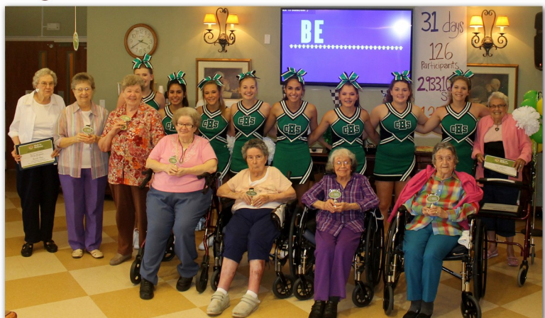
Walk to Wellness winners with the CHS cheer squad.