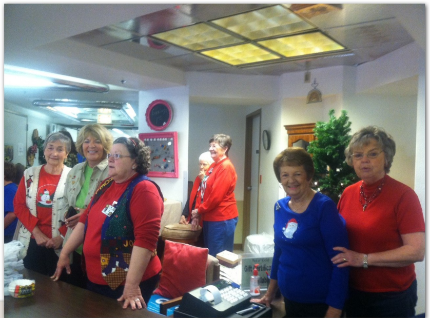
Clockwise from top left: Volunteers display quilts at 2014 Quilt Auction; Guests viewing the quilts before the auction; Volunteers ready for the Saturday opening of the Pot O' Gold in December; Wine and Cheese event at the Health Center.