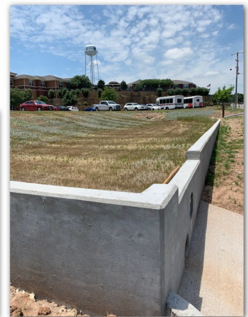
Water Retention Pond