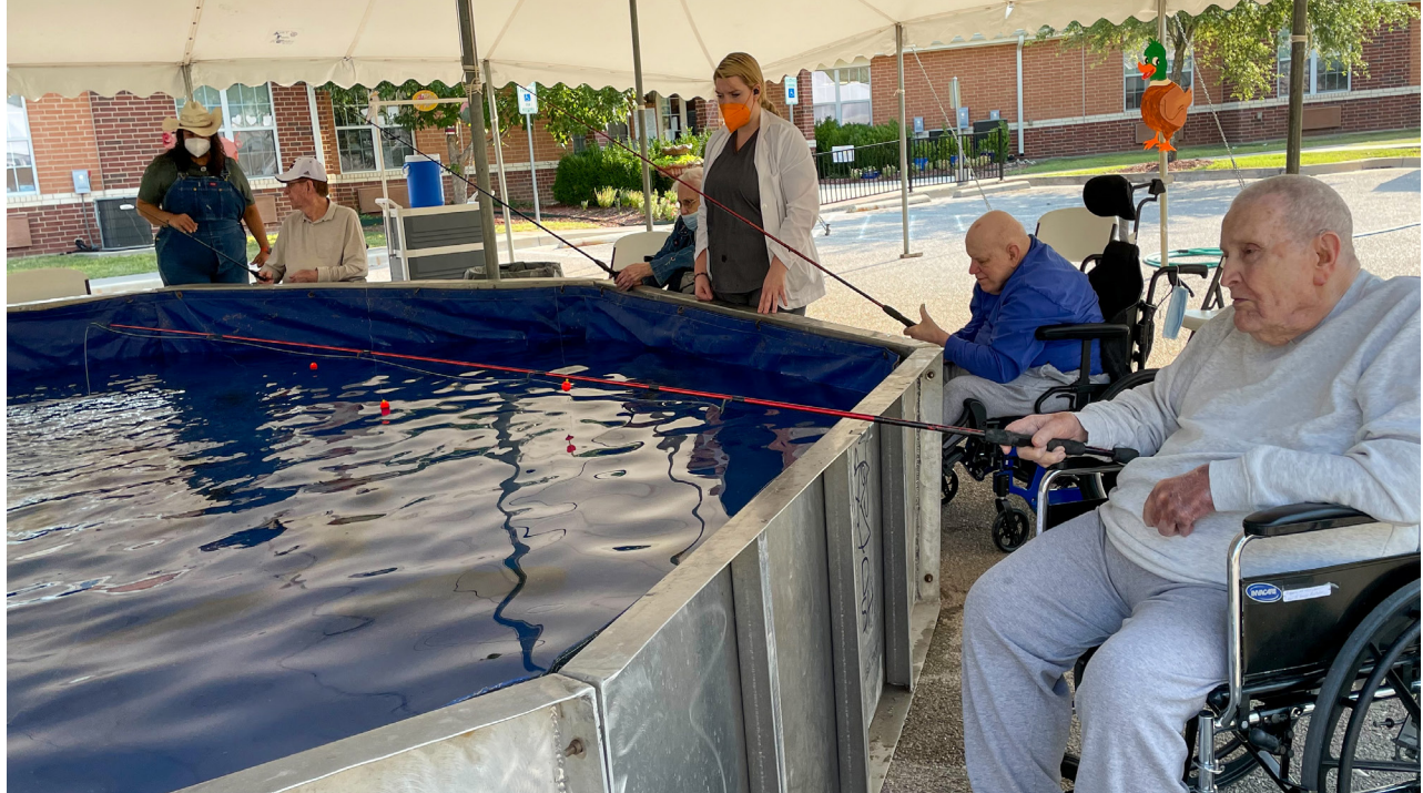
Staff and residents lined the edge of the tank for an afternoon of fishing.

The sun was shining, the birds were chirping and the fish were biting on the day of our annual Grandparent's Day fishing event. This celebration is always a huge hit with our residents, and this year was no different. Thanks to the KidFish Foundation, we were able to host this event for the tenth year in a row.