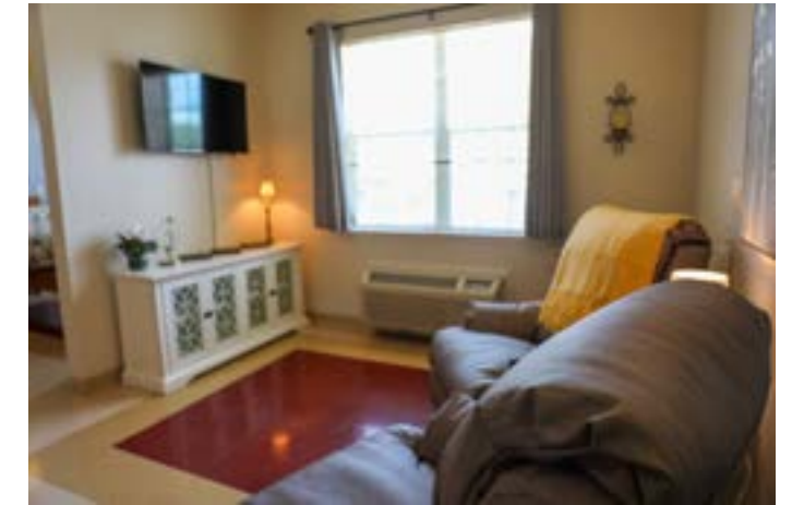
The new private rooms each have their own sitting area, equipped with recliners and a TV, perfect for relaxing and hosting visitors

The new rehab wing also features two private rooms for rehab stays, each with a sitting area, as well as a large dining room for socializing and visits. One resident told therapists that The Overlook is her favorite place in the whole building.