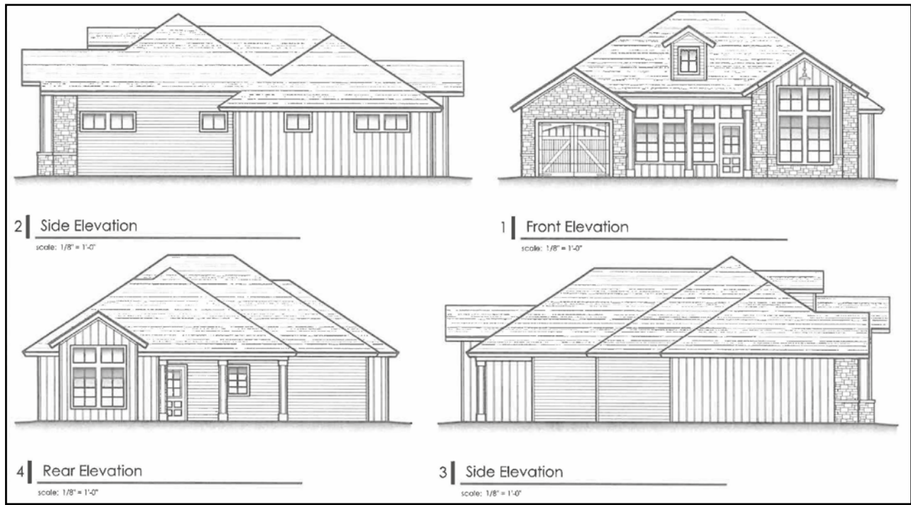
Elevations of the potential new independent living housing

Lutheran Sunset Ministries is looking into building more independent living housing for folks 62+. We have land at 700 South Avenue Q on which to build. This development would be a mix of single-family homes and duplex homes.