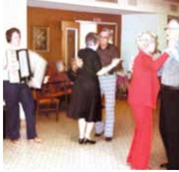
LSM residents enjoy a dance in the new nursing home (circa 1970s).