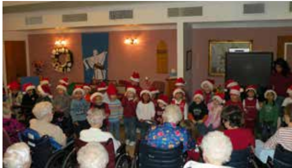
Residents enjoy a Christmas program from local children in 2008.