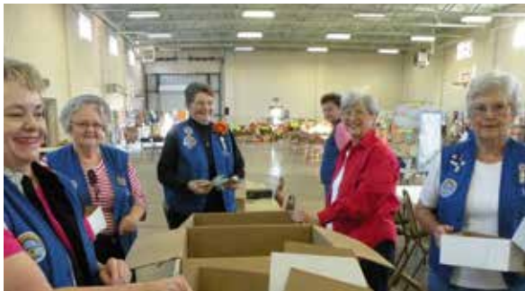
Members of the Sunset Auxiliary working at the Quilt Auction in 2009.

“Kids grow up coming to sing Christmas carols to our residents, or stopping by to trick-or-treat on Halloween. It’s the support of our community that has allowed LSM to flourish over the last 70 years!”