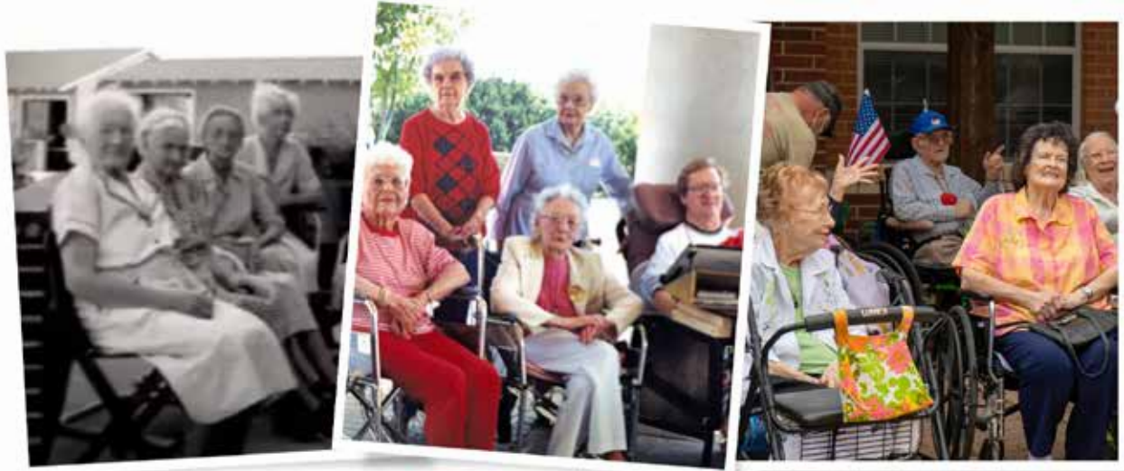
Sunset residents enjoying the fresh air through the years.

The year was 1954 — Eisenhower was president, Elvis Presley released his first single, “That’s All Right”, New York Giants centerfielder Willie Mays made “The Catch” against the Cleveland Indians in the World Series, White Christmas topped the box office and a group of Lutherans decided to turn the recently deserted buildings of Clifton College into a “home for the aged”.